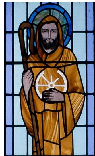
Saint Jarlath in stained glass, Kilbennan

Prayers e.g. Prayer for the Dead, (May their soul and the souls of ...), We Hold then close, (see Prayer Service), Prayers to various Saints